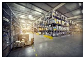
Value Added Distribution