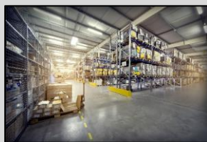
Value Added Distribution