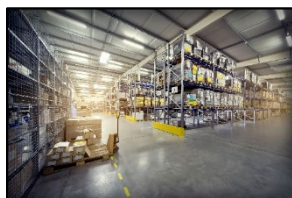
Value Added Distribution